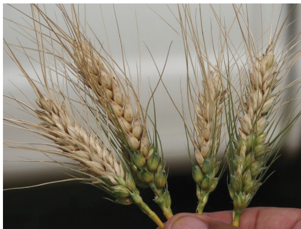
Figure 1. Typical symptoms of wheat blast infection on the spikes

The production losses caused by Pyricularia blast can vary from very low to almost 100%. The disease can attack all above ground parts of the plant, but severe spike infection can be observed with very little infection on the leaves or culms. Highest losses occur when the fungus attacks the rachis at the base of the spike thereby limiting the development of the grains and killing the spike completely.