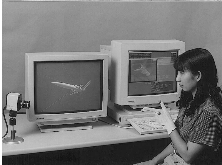
Figure 3: Vision interface using 3D hand gestures and a wireless glove.

Movement of the hand results in relative image motion between the images of the coloured markers. The parallax motion vector and the divergence, curl and deformation components of the affine transformation of an arbitrary triangle of points are sufficient to determine the projection of the axis of rotation, change in scale (zoom) and the cyclotorsion. This information is sent to a computer graphics workstation and the image of a model is changed accordingly (translation, rotation and change in scale).