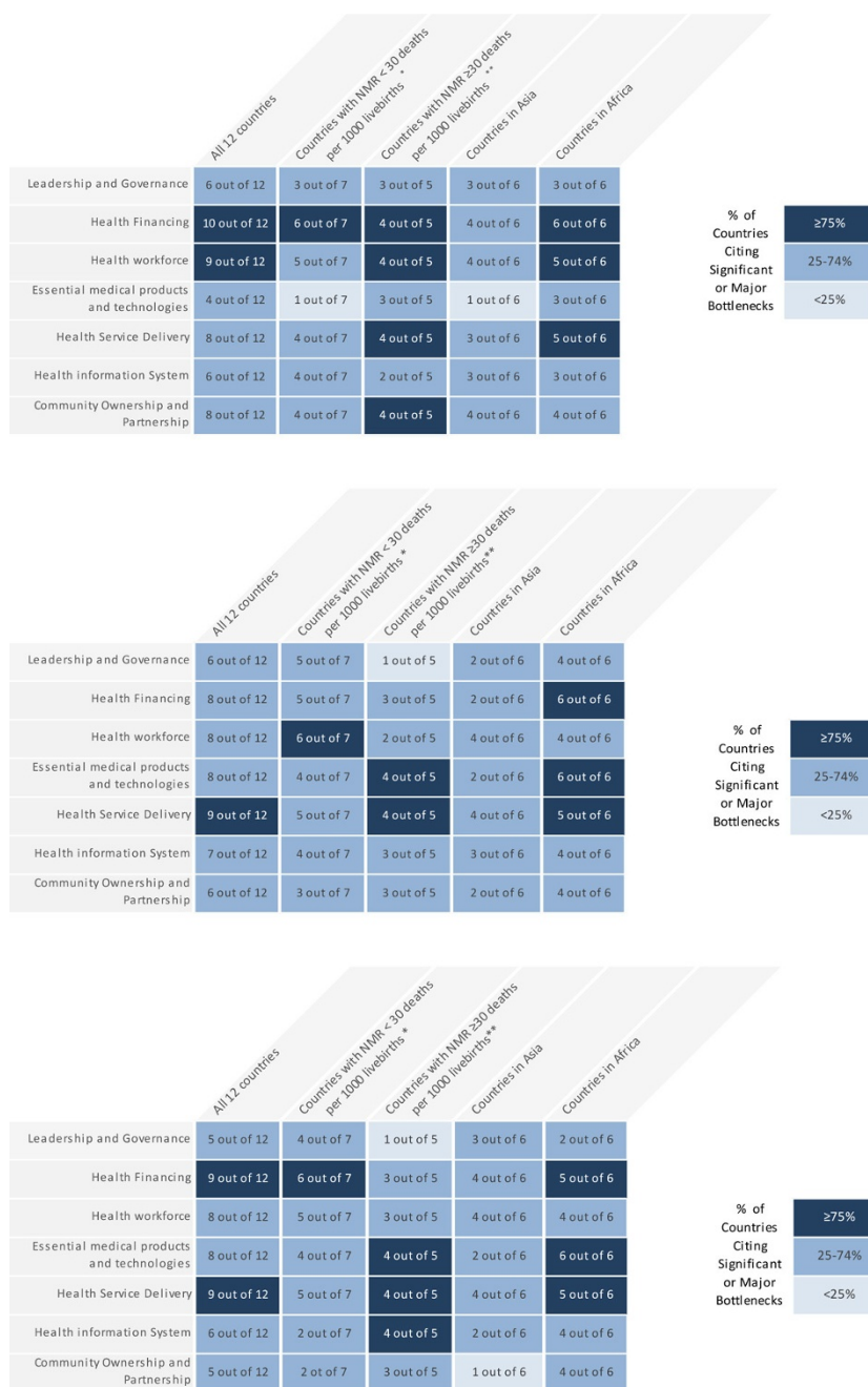
Figure 2 Very major or significant health system bottlenecks for labour and birth. NMR: Neonatal Mortality Rate *Cameroon, Kenya, Malawi, Uganda, Bangladesh, Nepal, Vietnam. **Democratic Republic of Congo, Nigeria, Afghanistan, India, Pakistan. See additional file 2 for more details. Part A: Grading according to very major or significant health system bottlenecks for skilled birth attendance as reported by twelve countries combined. Part B: Grading according to very major or significant health system bottlenecks for basic emergency obstetric care (BEmOC) as reported by twelve countries combined. Part C: Grading according to very major or significant health system bottlenecks for comprehensive emergency obstetric care (CEmOC) as reported by twelve countries combined.

standards for essential care at all levels, including in the private sector. Teams suggested improved context-specific planning at all levels in order to reduce unmet need and address inequities by focusing on marginalised and hard-to-reach population groups. The need for rational