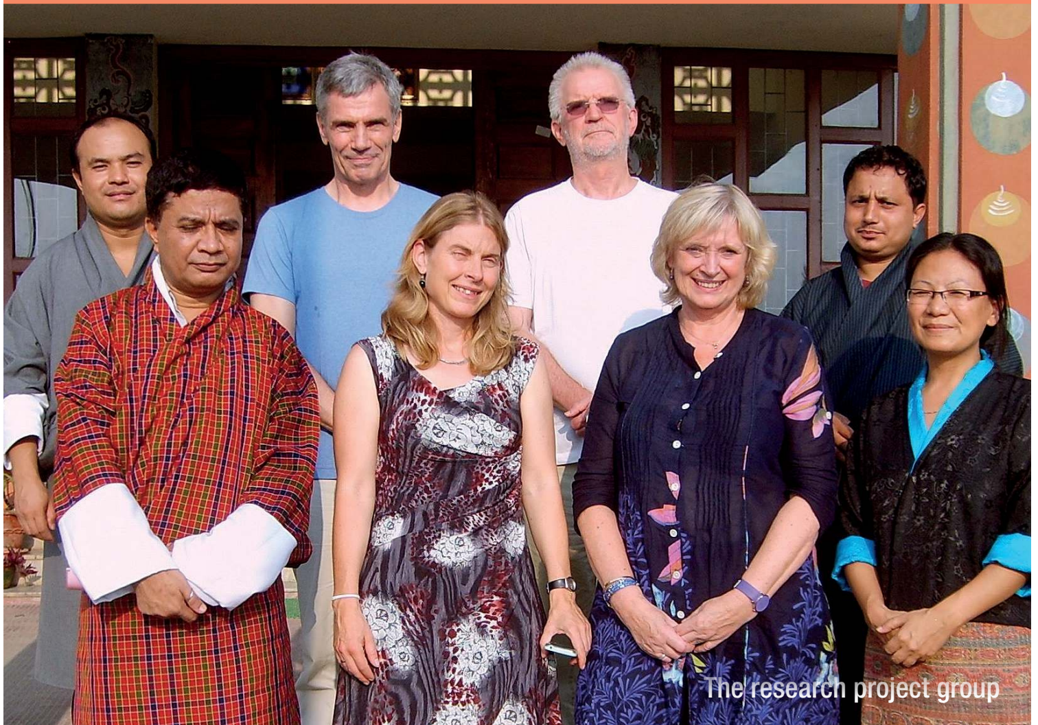
The research project group