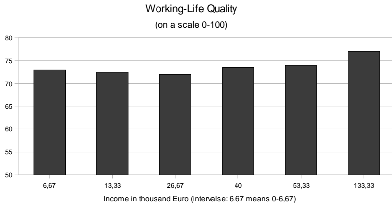
Fig. 1: Coherence between working-life quality and annual income. In a quality of life survey 2,500 Danes were asked to state their annual income as well as their level of job satisfaction. The height of each column corresponds to the average measured well-being at work (90% = 'very good', 70% = 'good', 50% = 'neither good nor bad', 30% = 'bad' and 10% = 'Very bad'). The diagram illustrates that well-being at work is unrelated to annual income, as all income groups feel equally well at work except for the highest income group, which shows an insignificantly higher degree of well-being than the other income groups.