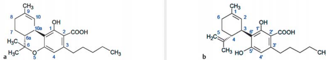
► Fig. 1 \Delta^9 -Tetrahydrocannabinol acid THCA (a) and Cannabidiol acid CBDA (b) are the target cannabinoids in medicinal cannabis. By decarboxylation at C-2 they are inverted to the pharmacological active constituents in medicinal cannabis.