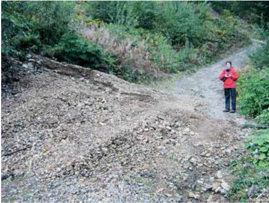
Fig. 5. Small debris flow at Krasnaya Polyana.

In addition to these major debris flow types the small debris flows are wide spread on a local level. Such small debris flows (Fig. 5) form in the territories exposed to anthropogenic activities (roads, rail road, new construction sites), and repeat annually. Their volumes are normally the first dozens of m^3 .