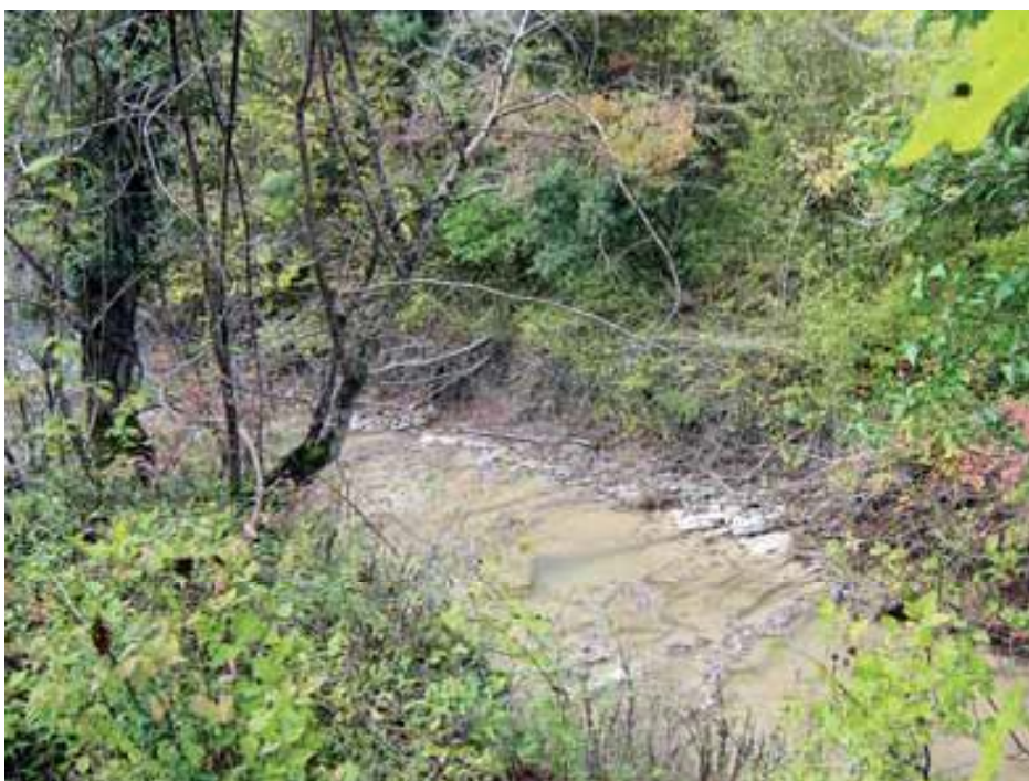
Fig. 4. The bed of the Khotsetai river, which the debris floods are passing through.

Debris floods usually form in middle and low altitudinal zones (Fig. 4). The causes of formation are intensive showers and the waterspouts entering the land. Most often they take place in summer-autumn seasons. The recurrence is once per 10 years.