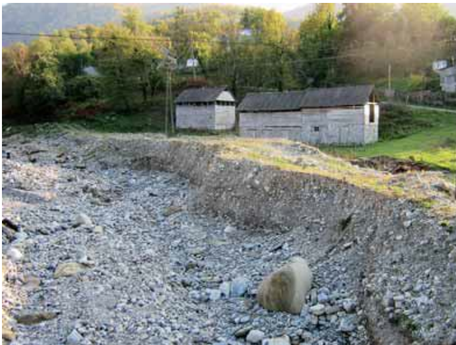
Fig. 3. The debris flow bed in the upper reach of the Ashe river near Lygatkh settlement.

The causes are the intensive short showers, long heavy showers and intensive snow melt accompanied by liquid precipitation. They usually form in the time period from June to October. Snow debris flows are rare and form in March–April. The recurrence of smaller debris flows (below 1000 \text{ m}^3 ) is once per 3–5 years. The larger ones (up to 10\,000 \text{ m}^3 ) take place once per 15–20 years. The