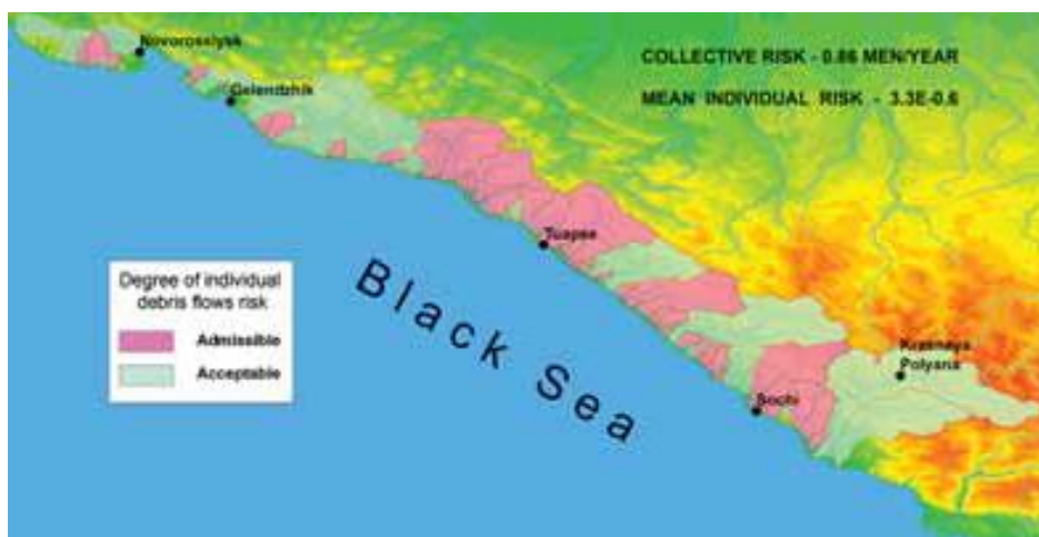
Fig. 6. Social risk in the Black Sea Coastal region of the Northern Caucasus.

were identified. The morphometric characteristics of each basin were calculated (area, inclination, the degree of exposure of a territory to debris flow hazard). The reoccurrence of debris flows was extracted from previous publications describing such characteristics of debris flow activity at the regional level. The duration of the debris flow season was taken from Belaya [2004]. The population numbers were taken from the 2002 population census and the population allocation inside the basins was assessed during the field trip. All data were gathered in a unified database.