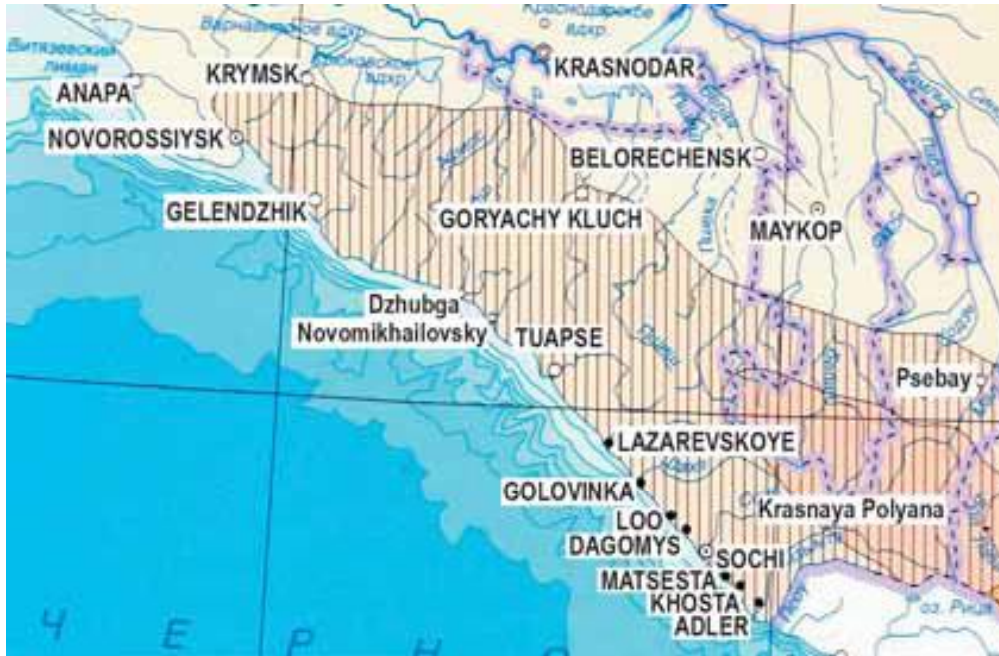
Fig. 2. Fragment of map of the debris flows danger [Atlas, 2007]. The colors correspond to low and medium degree of danger, the hatching corresponds to the showers-related debris flows.