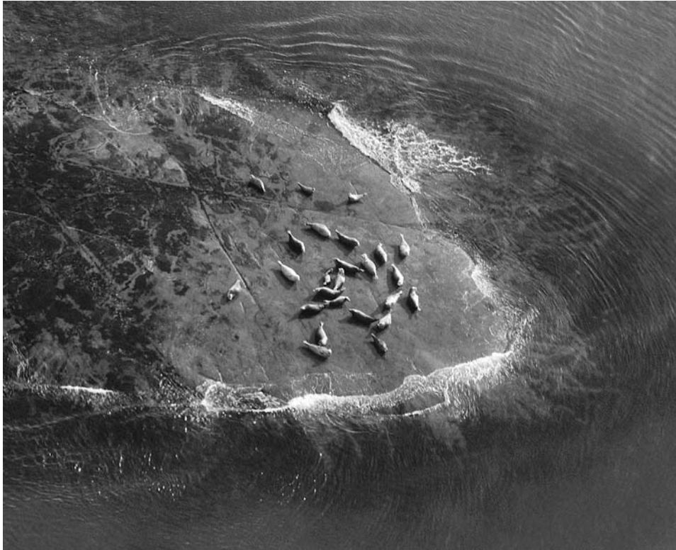
PLATE 1. Hauled-out harbor seals photographed during aerial surveys.

adjusted to conditions of the covariates that yield the maximum counts (we call these the optimum conditions). Observed counts are adjusted to optimum conditions because it is not possible to be at every site at low tide at noon every day of every annual survey period due to tidal fluctuations, weather, and logistics (Ver Hoef and Frost 2003). The optimum date for both quasi-Poisson and negative binomial regression was the earliest date, 18 August. However, the adjusted estimate of harbor seal abundance using a quasi-Poisson regression was 38 884 on 18 August, while using a negative binomial regression it was 80 609. Clearly, the choice of the regression method has a large impact on our abundance estimate.