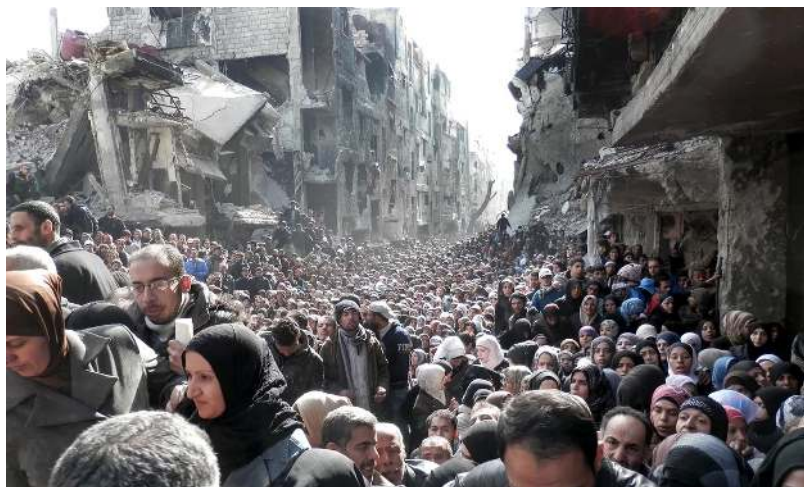
Figure 4: Yarmouk Refugee Camp, photo by UNRWA, 2014

world's attention" by the BBC , 365 and given a clickbait title in the Huffington Post proclaiming, "This one photo will show you just how terrible the Syrian refugee crisis is." 366 This photograph is jarring because of the immeasurable amount of people packed into the image's frame and the desolate ruins that tower above them on both sides.