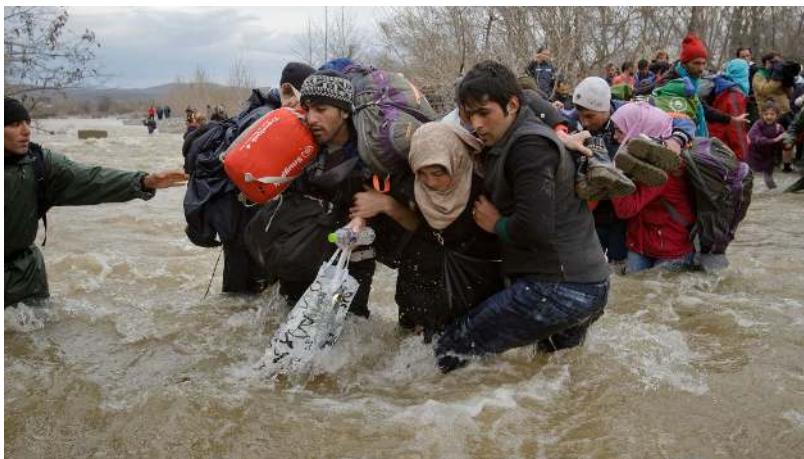
Figure 5: Refugees in Greece, photo by Vadim Ghirda, Associated Press, 2016

While Malkki's observation of the most common subjects of refugee photography holds in recent refugee photojournalism, my survey of refugee photography led me to observe several other visual features common to most available refugee photographs. Two elements appear in combination in most of the refugee photographs I surveyed: expressions of pain or suffering and depicted or implied movement (that contributes to a sense of temporariness). Many photographs depict movement toward the camera and feature a frenzied, chaotic scene that illustrates the urgency with which refugees must move. These often depict a group of people running onto a beach; the splashing water and strained faces indicating the effort exerted in the movement.