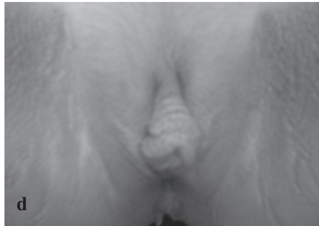
Fig 2. Clitoromegaly of the same patient