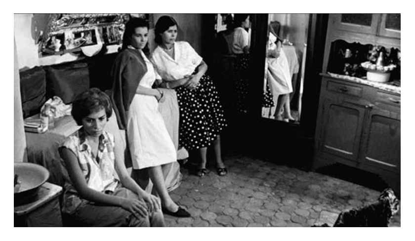
The women of The Battle of Algiers (dir. Gillo Pontecorvo, Italy/Algeria, 1966)

address the black-versus-white history that dominates the race discourse of the US; instead it speaks to global colonial relations through the particulars of the Algerian uprising. While screening the primarily unseen of Muslim culture at the time to the West, Battle presents a story of uprising that exposes the hidden philosophy of a terrorist cell structure (distributed, not hierarchical). What we see as viewers and what the colonial forces fail to see in the diegetic space sustains a dramatic tension throughout the film. In the case of the colonial French army guarding the borders between native and French quarters, the elision of visual marker between friend and foe proves deadly.