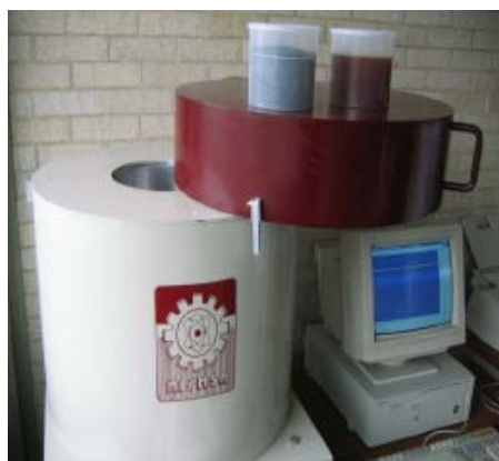
Figure 1. Low background scintillation detector and Marinelli containers.