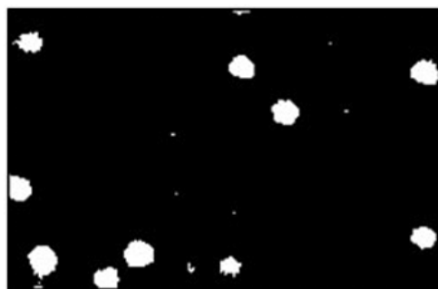
Figure 2. The tracks of alpha particles formed on LR-115 plastic track detector

Following the exposure for a stipulated period (about 100 days), the LR-115 films (SSNTDs) are chemically etched in 2.5N, NaOH (sodium hydroxide) solution in an etching bath with a magnetic stirrer at a temperature of 60 °C for about one and half hour for developing the tracks recorded and registered in the films (figure 2). The etching process removes a bulk thickness of 4 \mu\text{m} leaving a residual detector thickness of 8 \mu\text{m}