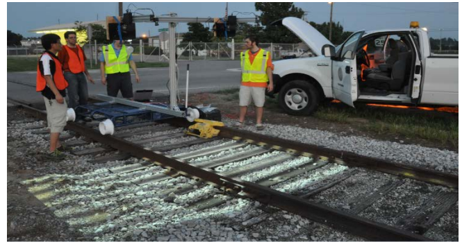
Figure 2. Field Test at the crossing (USDOT 719862A) on Beasley Rd. Versailles, KY.

foot overlapped area in the longitudinal direction with the other scans before and after it. Two scanned 3D point clouds were shown in Figure 3.