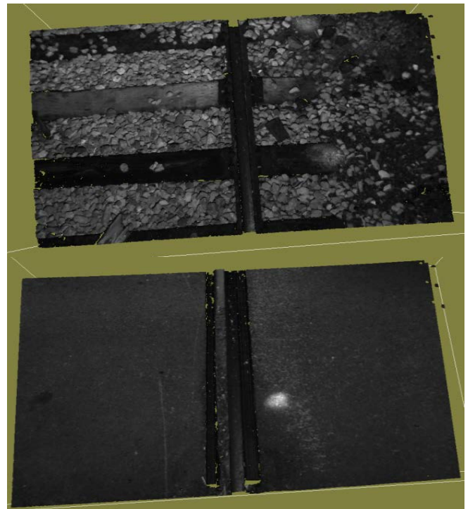
Figure 3. Sample of data collected in the field.