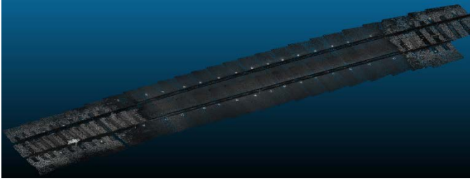
Figure 4. A highway rail crossing surface 3D point cloud.

After all the 3D point cloud tiles were merged into one crossing surface, each point had X, Y, Z coordinates recorded (to the nearest millimeter). A color-coded rendering of the crossing surface elevations can be seen in Figure 5. Blue indicates lower elevation, while red shows the higher elevations. With the 3D point cloud, the distance between any two points of the crossing can be measured. Locations where a vehicle (truck, trailer, etc.) may get high-centered or hung-up on the crossing may be directly computed given vehicle dimensions of wheel base and clearance height.