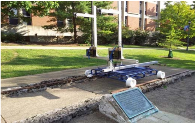
Figure 1. DAS prototype.

As a scanner platform, a rail cart was built to include a frame with wheels, a laptop computer with structured light data capturing software, an 1100 watt AC/DC converter, power cables, and power provided by the battery of a test vehicle as shown in Figure 1.