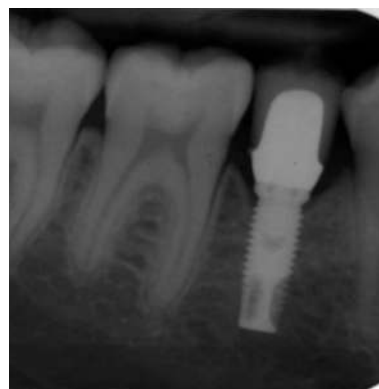
Fig. 3 a, b: Clinical situation of an all-ceramic implant crown, cemented on a zirconia abutment (test group) at crown insertion. Radiograph at baseline