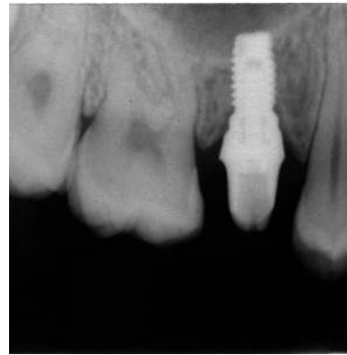
Fig. 2 a, b: Clinical situation of a metal-ceramic implant crown, cemented on a titanium abutment (control group) at crown insertion. Radiograph at baseline.