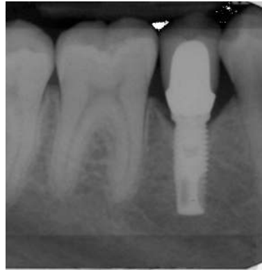
Fig. 3 c, d: Same patient with the all-ceramic crown cemented on a zirconia abutment at the 3-year follow-up. Radiograph at 3-years.