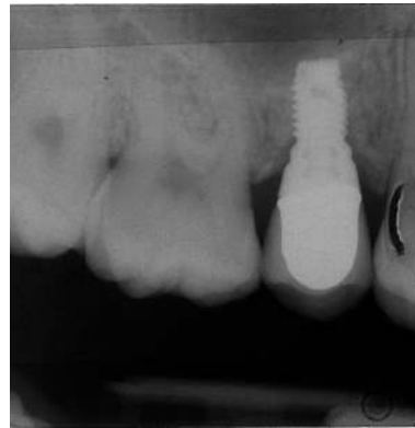
Fig. 2 c, d: Same patient with the metal-ceramic implant crown cemented on a titanium abutment at the 3-year follow-up. Radiograph at 3-years.