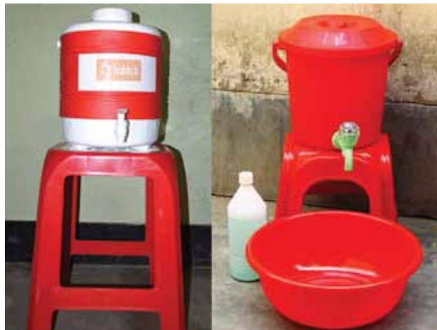
Figure 1. Cholera-Hospital-Based-Intervention-for-7-Days (CHoBI7) Intervention hardware, Dhaka, Bangladesh, June 2013–November 2014. The kit contained a water vessel with cover, chlorine tablets, hand washing station, and bottle of soapy water.

Study recruitment at Dhaka Hospital occurred Saturday–Thursday each week during the study period. Each