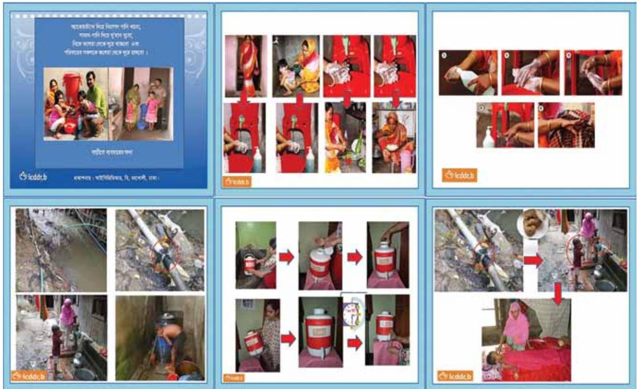
Figure 2. Promotional flipbook and cue cards about hand washing with soap and treatment of water, Dhaka, Bangladesh, June 2013–November 2014. Cue cards are placed next to intervention hardware as a cue to action on hygiene and water treatment–related behaviors.

week, half of the surveillance days were randomly selected to be intervention days, and half were randomly assigned to be control days by using a random number generator. The principal investigator (C.M.G.) assigned randomization; this scheme limited the likelihood of seasonal variations in study arm assignment and selection bias. The control arm received the standard message given at health facilities in Bangladesh about the use of ORS to treat diarrhea, and the intervention arm received this standard message and CHoBI7. To minimize bias, we used 2 separate teams for intervention and evaluation activities.