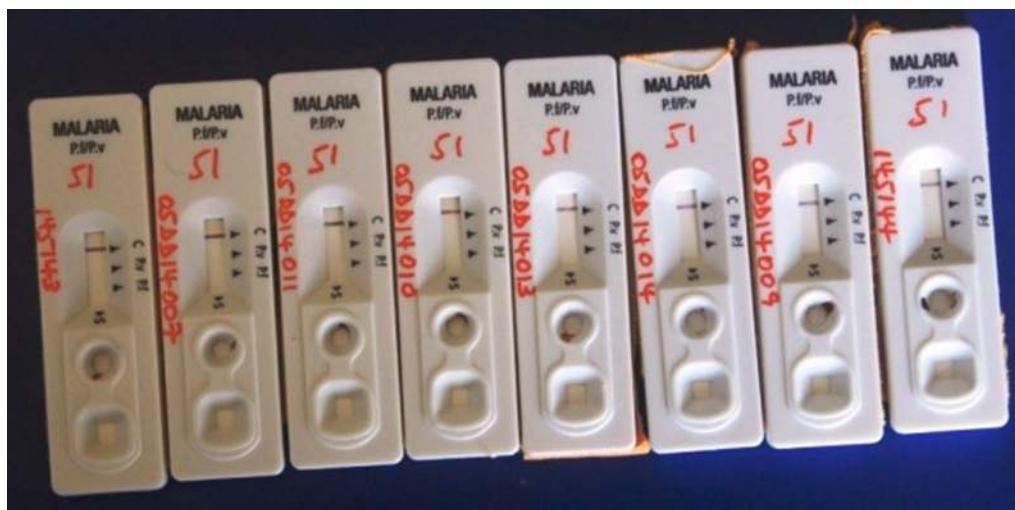
Fig. 2 Some of the false negative results of malaria RDTs

The joint assessment with the manufacturer of five P. falciparum patients yielded the following results. A known positive control, prepared at 2000 parasites/ \mu l, gave positive results when tested against all SD Bioline HRP2Pf/Pv RDTs whether they were retained with the manufacturer or those distributed to the field in Eritrea. However, the five malaria patients (all were microscopy confirmed P. falciparum -infected) could not be detected by all the RDTs, except with SD Pf/Pan type where the Pan-line band only turned positive to each of the specimens (Table 2). All the microscopically confirmed cases were also re-confirmed by PCR by SD at the manufacturing facility.