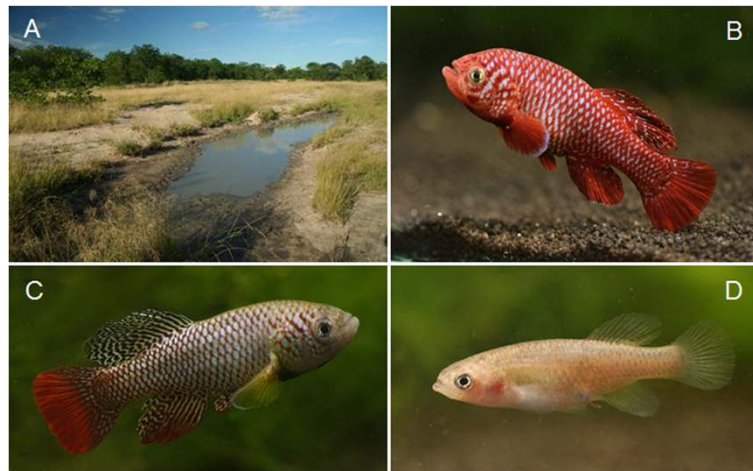
Figure 1 Study species and their typical habitat. (A) Typical habitat of the study species: a shallow savanna depression filled with water during the rainy season in Chefu region. (B) Male Nothobranchius kadleci . (C) Male Nothobranchius furzeri . (D) Female Nothobranchius kadleci .

(temperature 24.8 to 25.8°C). At eight days fish were transferred to 60 L tanks (27 to 28°C) with internal filtration. From the age when sex was discernable (11 to 14 days) until 21 days, the sexes were separated to avoid intense male sexual harassment [11]. Fish density was reduced to four males and eight females at 21 days and two males and four females at 42 days to approximate population densities in the wild.