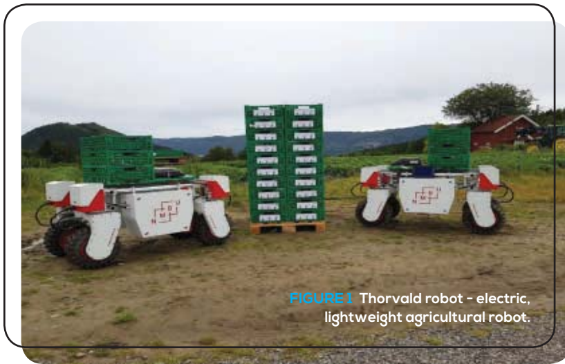
FIGURE 1 Thorvald robot - electric, lightweight agricultural robot.

Downloaded from http://asmedigitalcollection.asme.org/memagazine/article-pdf/140/06/S146384177/mem-2018-june.pdf by guest on 21 August 2022