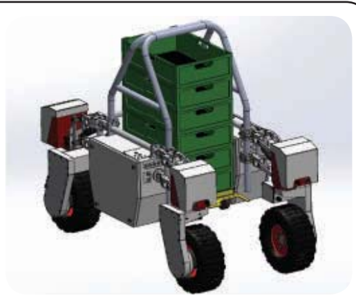
FIGURE 3 The initial trial of a robotic strawberry transportation system in polytunnels (left) and a dedicated design for an on-board picking tray storage (right).