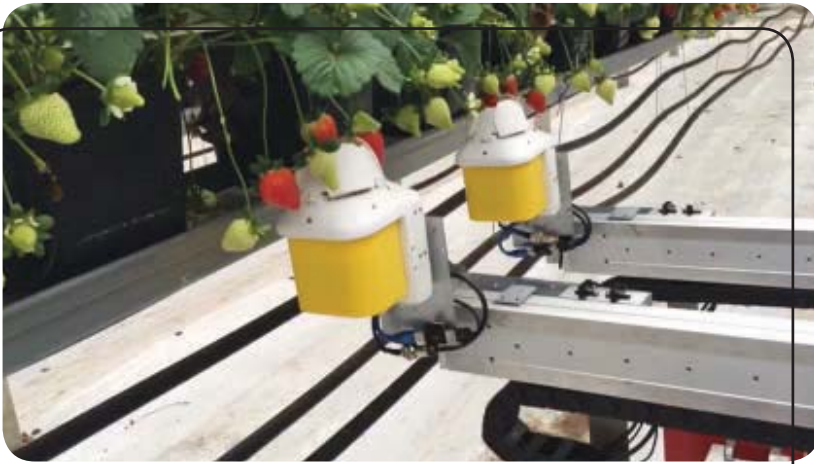
FIGURE 4 The two-arm strawberry picker mounted on the Thorvald platform.

generally viewed positively, with the behavior viewed as appropriate and safe. This was despite the participants having mixed views on robots in general, although they seemed less worried about the prospect of their work being directly replaced by robots, which is in contrast to an overall relatively negative view of robots in terms of job replacement reported in other areas of industry.