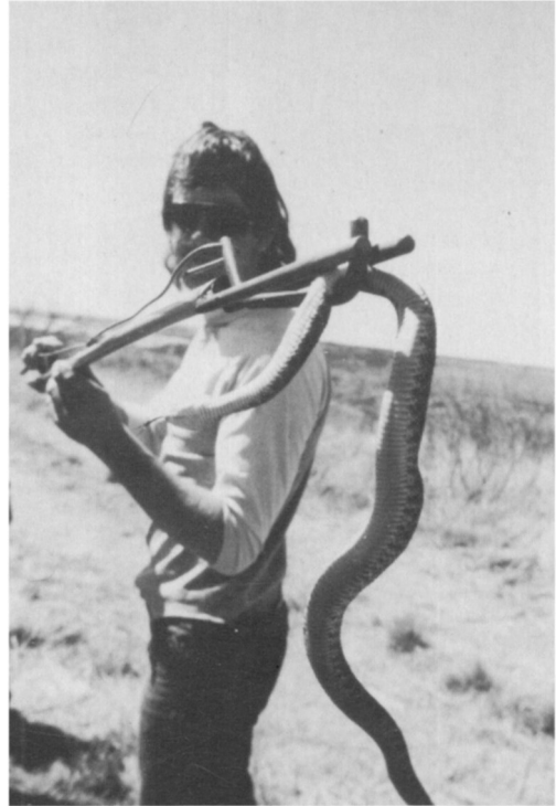
A snake hunter in Oklahoma displays his catch: a western diamondback rattlesnake Crotalus atrox.

reductions in the availability of snakes from areas where they were previously abundant, and that in isolated locations collection was no longer viable. However, round-up organizers are keen to suggest that populations of rattlesnakes are not threatened since their annual events have consistently harvested large numbers of snakes. Comments from snake hunters and round-up organizers in Oklahoma, however, report an increase in the numbers of individuals collecting snakes for round-ups, which supports the conclusion by Campbell et al. (1989). Hunters in Oklahoma, who also operate in Texas, also commented that they are having to increase their hunting ranges in order to collect similar numbers of snakes. Several experienced snake hunters, however, reported sustainable yields particularly from deep crevices.