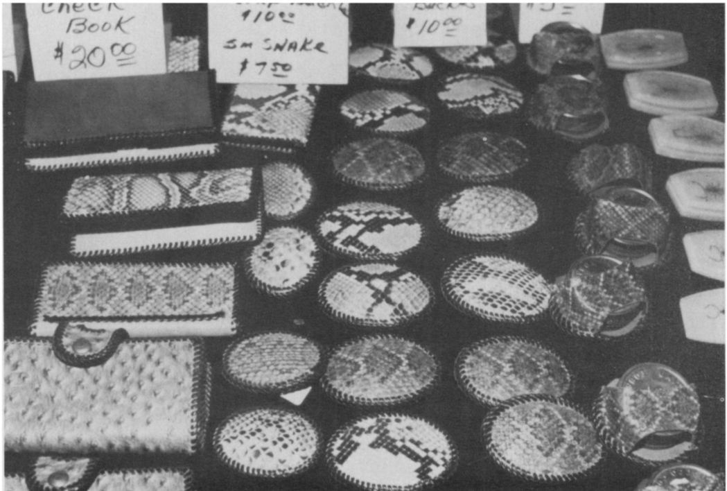
A small sample of the diverse products derived from rattlesnakes, along with items made from python skins and invertebrates (D. G. Barker).

turned in attempts to locate snakes and that habitat disturbance during searches for snakes is substantial, regardless of whether gas is used. Large rocks and crevices are more resilient to interference but nevertheless are subject to a certain amount of disruption.