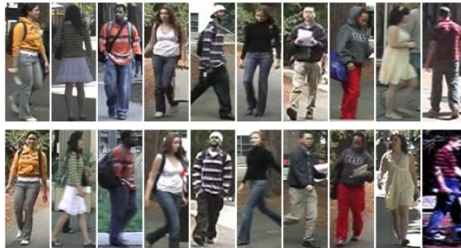
Figure 2: Examples of images from the VIPeR data.

The VIPeR dataset [19] is a publically available benchmark for viewpoint-invariant person re-identification algorithms. This dataset consists of two different recordings for 632 individuals (see Fig. 2). The data contains a wide variety of view-points and lighting.