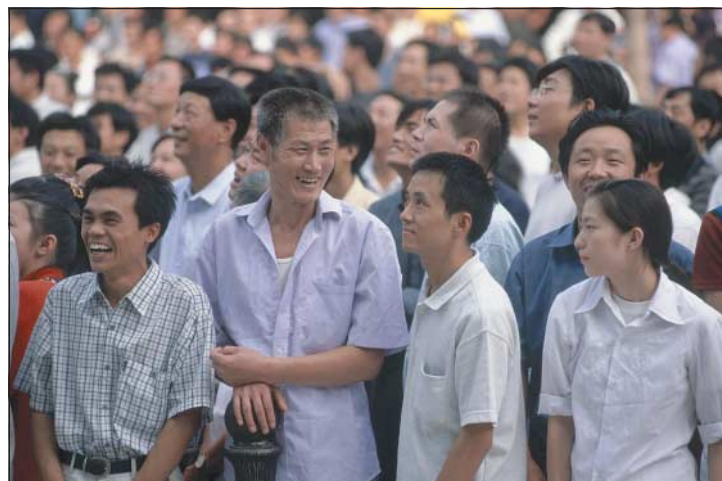
Cohort characteristics can confound only if they vary between comparison groups

Perhaps the most common strategy to identify important imbalances in individual confounders between intervention and comparison groups is to use significance tests such as \chi^2 tests (for dichotomous variables) or t tests (for continuous variables). A problem with these tests is that the significance levels are sensi-