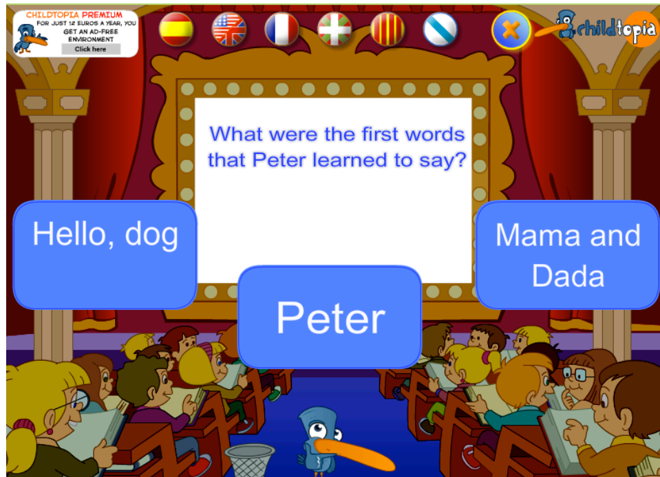
Figure 2: Example of post-reading comprehension question from ChildTopia™