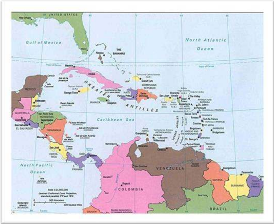
Map 1: Central America and the Caribbean