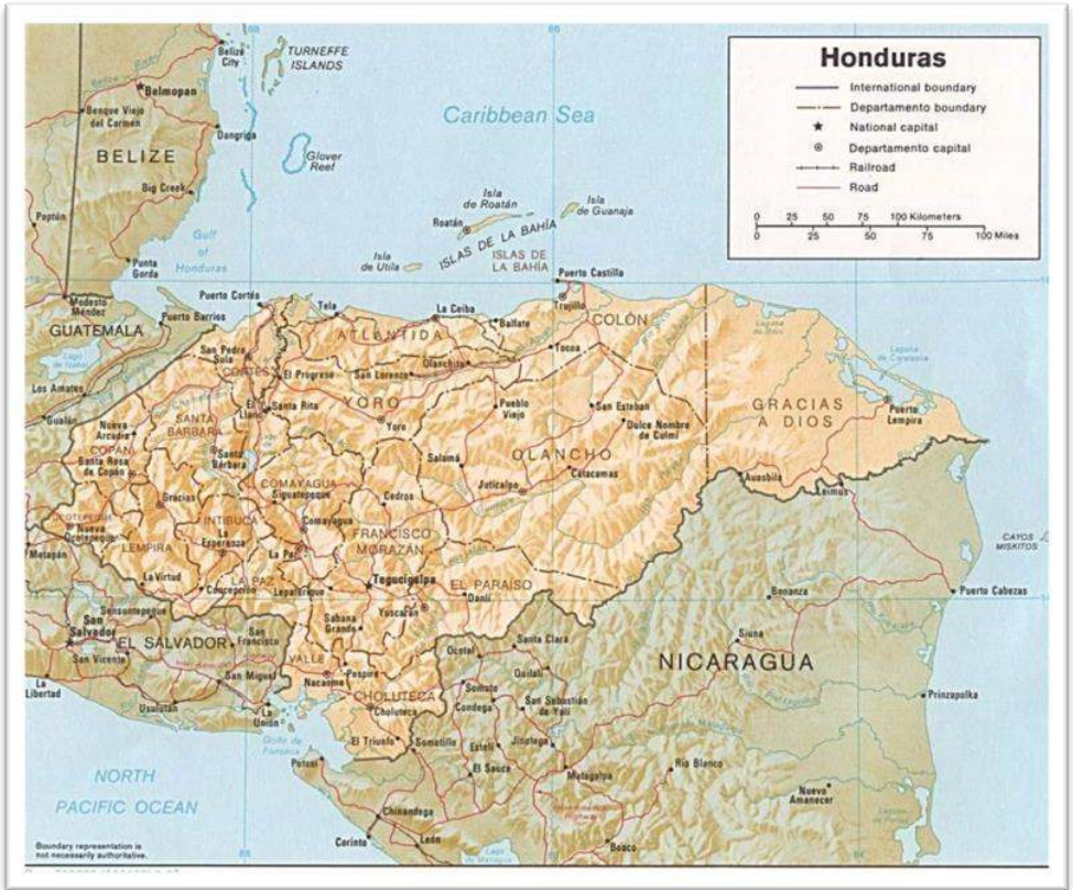
Map 2: Honduras, Overview