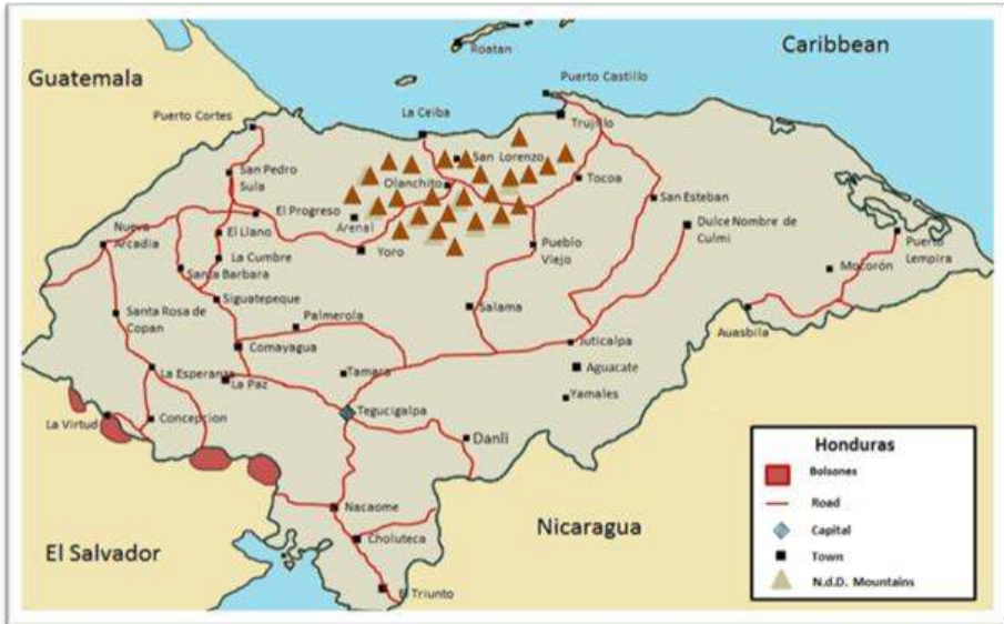
Map 3: Honduras and the Bolsones