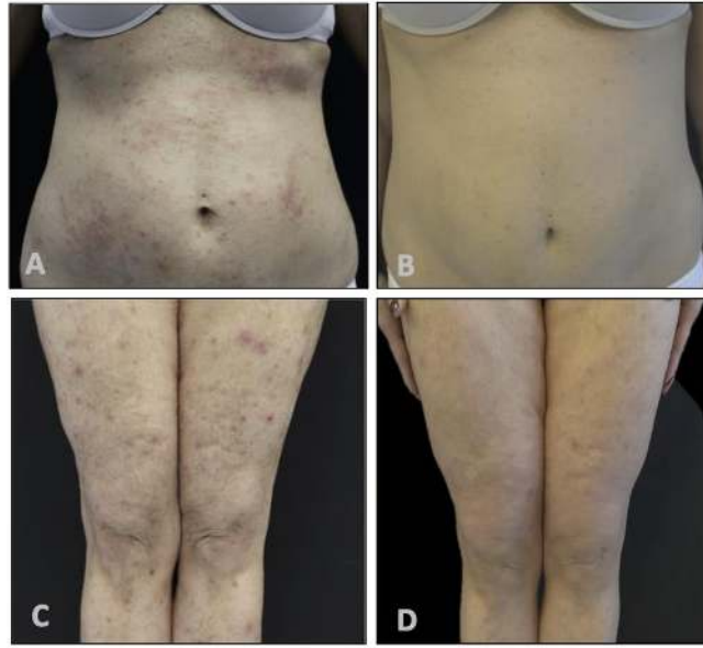
Figure 3. A 40 year-old patient affected by a persistent moderate-to-severe AD presenting with a classic adult-type phenotype before treatment (A,C - EASI score 24) and after 16 weeks of dupilumab treatment (B,D - EASI score 2).