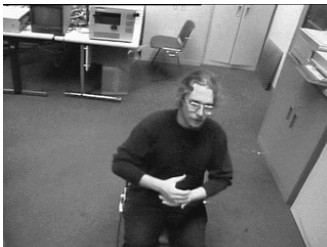
Fig. 2. View from the desk-based tracking camera. Images are analyzed at 320 \times 240 resolution.

Training for a second-person viewpoint is appropriate in the rare instance when the translation system is to be worn by a hearing person to translate the signs of a mute or deaf individual. However, such a system is also appropriate when a signer wishes to control or dictate to a desktop computer as is the case in the first