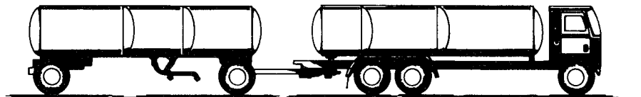
Typical Compartment Configuration (Trailer aft; truck forward) Gasoline: 2000, 900, 1700; 900, 1200, 2000 Diesel: 1500, 750, 1500; 700, 1000, 1700 (Gal.)

Each vehicle is assigned a sequence of loads for a shift with the duration of each shift determined by driver availability, vehicle availability, and contract terms. Overextension of vehicle shifts leads to overtime labor costs, disrupts following shifts, and can foment employee dissatisfaction. Underutilization of vehicles causes other similarly unfortunate outcomes, the most obvious being economic.