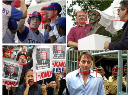
(b) Examples on FDDB