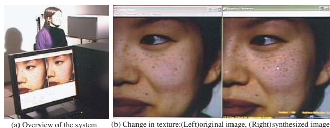
Figure 3: Real-time processing using our developed system.

For real-time processing, a beam splitter is placed between two cameras at 45 degrees. The two video signals obtained through the different orientations of the polarizer are digitized into the personal computer. In the computer's CPU, the two images are processed into specular, shading, melanin and hemoglobin components. This operation is achieved at 25 frames per second by using a lookup table for the diffuse reflection image. All components are transferred into the graphics processing unit (GPU) for control of the texture by user interface tools such as the mouse and keyboard. The graphics hardware synthesizes the controlled components of the image to display on the monitor. The graphics processing unit can perform at 28 frames per second in these processes, but only 17 frames per second performance for video stream processing is possible due to the bottleneck at the connection between the CPU and GPU. Figure 3 shows examples of the real-time processing of a human face.