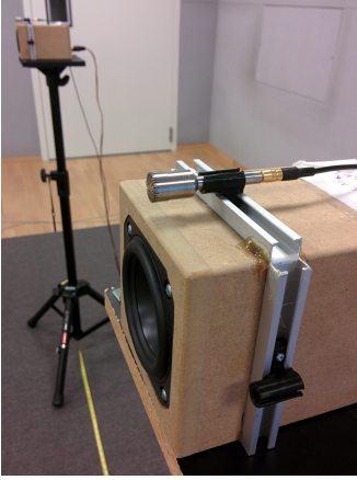
Fig. 1. A picture of the stereo setup.