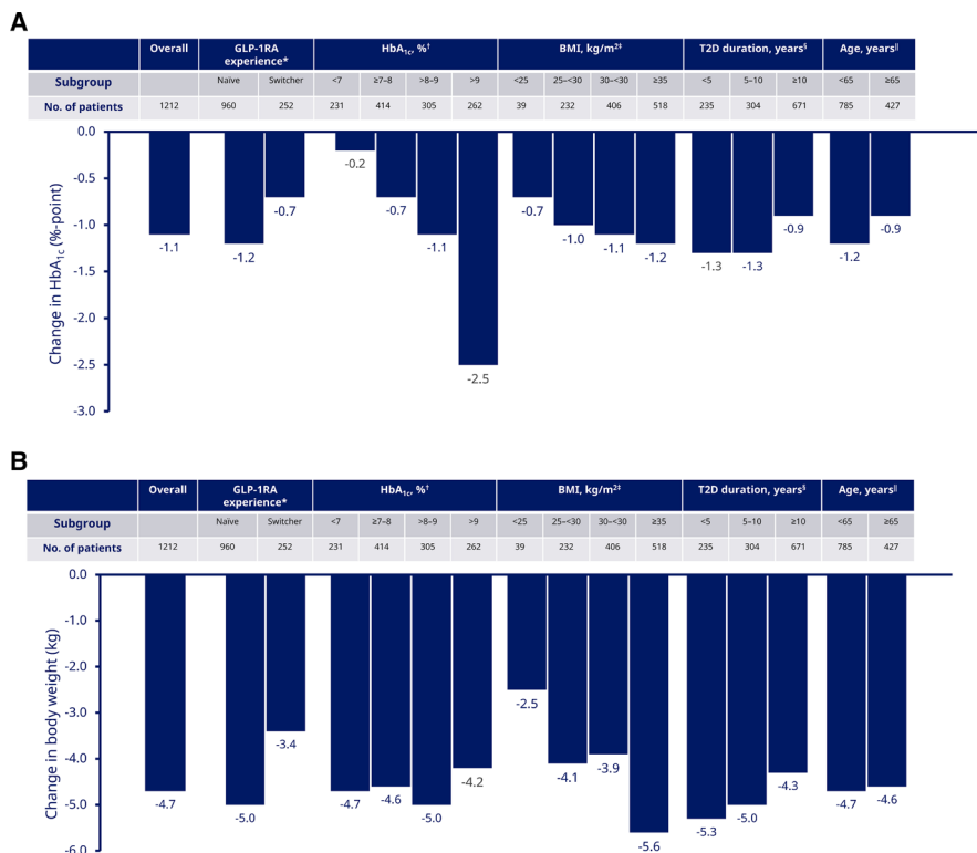
Figure 1 (A) Change in HbA 1c from baseline to EOS in overall population and subgroups; (B) change in body weight from baseline to EOS in overall population and subgroups. Data are from the full analysis set, in-study period that represents the time period during which patients are considered to be in the study, regardless of semaglutide treatment status. Response was analyzed using baseline T2D duration, age, BMI, time, time-squared, preinitiation use of DPP-4i, preinitiation use of insulin, preinitiation use of GLP-1RAs, GLP-1RA (except in ‘GLP-1RA experience’ subgroups), number of OADs used preinitiation (0–1/2+) and sex with random intercept and random time coefficient (slope). (A) All p values for change from baseline to week 30 are significant at <0.0001. Interaction p value for difference between subgroups: *p=0.0003; † 0.0209; ‡ 0.9354; § 0.1944; ¶ 0.3504. (B) All p values for change from baseline to week 30 are significant at <0.0001 except p=0.0092 for baseline BMI of 25 kg/m 2 . Interaction p value for difference in change between subgroups: *p<0.0001; † 0.8730; ‡ 0.5791; § 0.8419; ¶ 0.7569. BMI, body mass index; DPP-4i, dipeptidyl peptidase-4 inhibitor; EOS, end of study; GLP-1RA, glucagon-like peptide-1 receptor agonist; HbA 1c , glycated hemoglobin; OAD, oral antihyperglycemic drug; T2D, type 2 diabetes.

dose; 3 (0.3%) were receiving a dose between 0.25 and 0.5 mg; 274 (27.8%) were receiving a 0.5 mg dose; and 13 (1.3%) were receiving a dose between 0.5 and 1.0 mg. The majority of patients (576 (58.5%)) were taking the 1.0 mg dose and 2 (0.2%) were taking a dose >1.0 mg. The use of doses <0.25 mg and between 0.25 mg and 0.5 mg, between 0.5 and 1.0 mg, and over 1.0 mg is off-label and occurred because of the studies’ non-interventional nature.