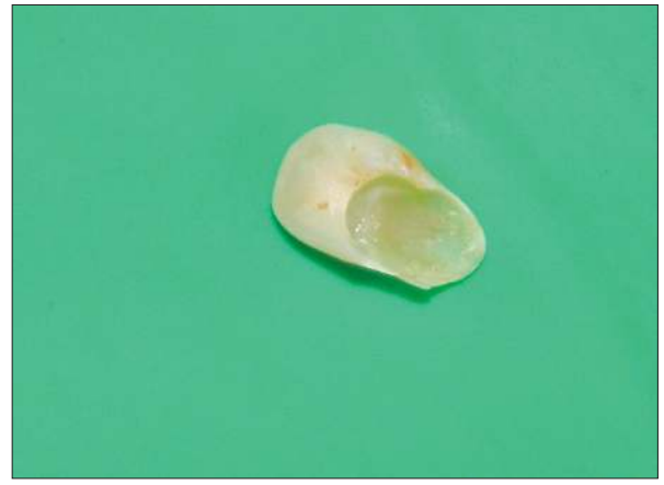
Figure 5. Decay was removed from inner part of the crown.