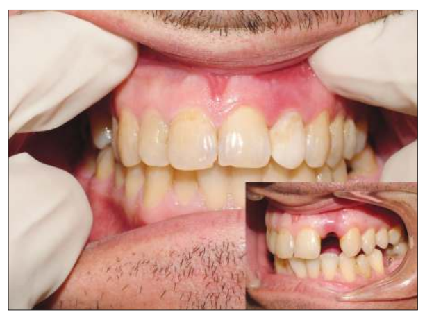
Figure 6. Final restoration.