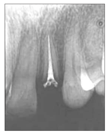
Figure 3. Endodontic treatment was finished with gutta-percha and endodontic sealer.

enlarged to ISO size 60 at working length. 2.5% Sodium hypochlorite was used during the preparation. The root canal was dried with paper points (Spident, Hand Rolled, Korea) and obturated using endodontic sealer (Sealapex, Kerr, USA) and laterally condensed with gutta perca technique (Spident, Hand Rolled, Korea) (Figure 3). The coronal portion of the root canal obturation was removed with a heat carried instrument for the placement post-system. The root canal was obtu-