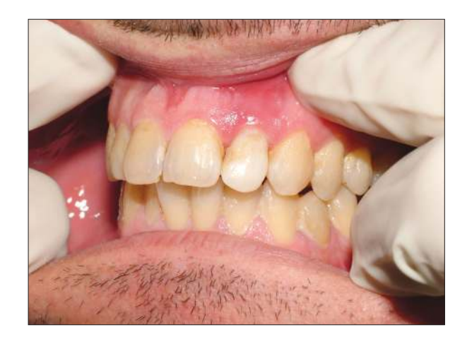
Figure 8. 1 year follow-up.