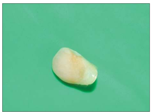
Figure 2b. Fractured tooth crown.

Local anesthetic was administered and the segment was removed (Figures 2a and 2b) with minimal force from its soft tissue attachment and recovered and stored in sterile distilled water to prevent discoloration and dehydratation. The working length was determined with an electronic apex locater (Root ZX, J.Marita Corp., Kyoto, Japan) and confirmed with radiography. The gates glidden drills (Mani Inc, Japan) were used for coronal segment of the root canal. The root canal was