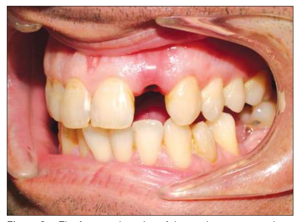
Figure 2a. The fractured portion of the tooth was removed.

the soft tissues in the extra oral and intraoral examination. Clinical and radiographic examination revealed that there was a horizontal fracture in the cervical region of the left maxillary incisor. It was tender to percussion, and there was a temporary restoration of the palatal region of the tooth. Dental history of the patient revealed that an endodontic treatment was started nine months ago, but incompleted because of the patient's anxiety from dentists. The crown was mobile but attached to the gingiva. In radiographic examination, the fracture line was below the cement-enamel junction (Figure 1). There was no evidence of abscess formation. There was no sign of trauma to the adjacent teeth and they were vital. It was explained to the patient that the placement of a dental implant could be indicated if an unfavorable crownto-root ratio would result after completing crown reattachment. The patient expressed the desire to maintain tooth and restore it with a direct resin based composite restoration, due to the lower cost compared to an indirect restoration. A detailed explanation about the treatment plan was given to the patient, which included completion of the endodontic treatment, then reattachment of the tooth crown with using a fiber post. The treatment plan was accepted by the patient.