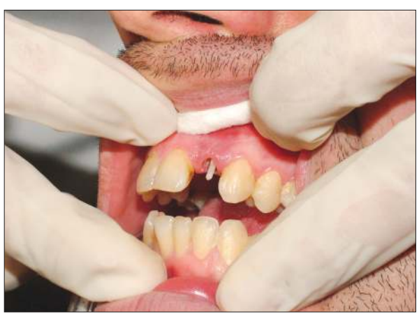
Figure 4. Parallel sided post was placed.