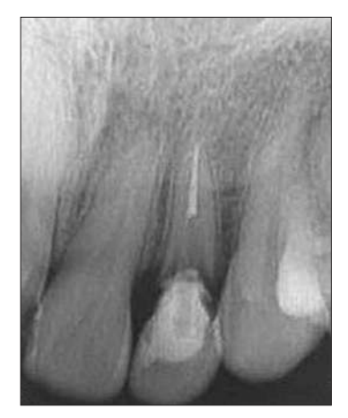
Figure 7. 1 year follow up with radiographically.