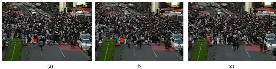
Figure 5. Tracking results for the “Crowd” sequence. (a) 1 th frame; (b) 300 th frame; (c) 640 th frame.

Figure 2 shows a set of frames from a video sequence recorded in a train station with a total number of frames of 450. On the other hand, the pedestrian to be tracked corresponds to a woman who is wandering around. She is selected in the first frame by placing in her a square-shape region of 10 \times 10 pixels. The selected pedestrian is occluded by another person who is walking in the opposite direction to her from the 50 th to 180 th frame in the video sequence.