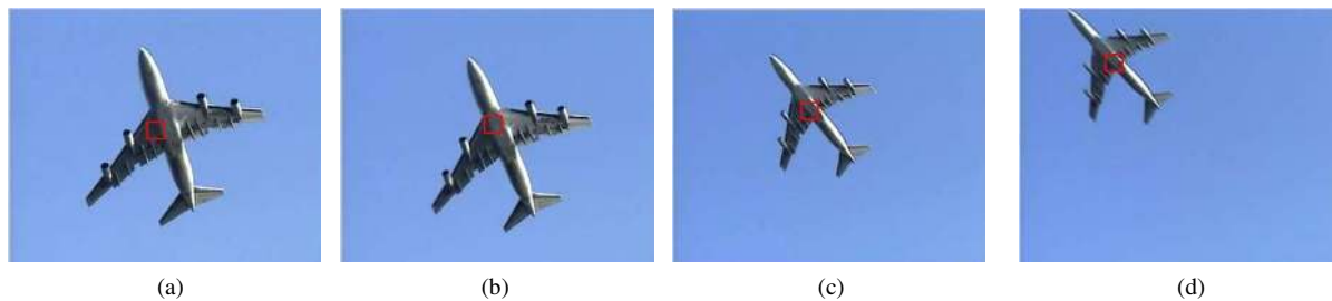
Figure 4. Tracking results for the “Plane” sequence. (a) 1 th frame; (b) 250 th frame; (c) 450 th frame; (d) 550 th frame.