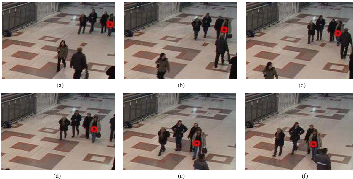
Figure 2. Tracking results for the “Train” sequence. (a) 1 th frame; (b) 80 th frame; (c) 160 th frame; (d) 240 th frame; (e) 320 th frame; (f) 450 th frame.

Initially, it is defined a region of interest, R , in the first frame of the video. This region is placed in such a way that it is completely inside the object to be tracked. Then, the proposed algorithm updates automatically the location of this region of interest for all the remaining frames of the video sequence. Different urban scenarios were used for testing, and some of the results obtained for these testing videos are shown from the Figures 2-5 .