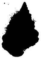
3c ( \times 2\frac{1}{2} )