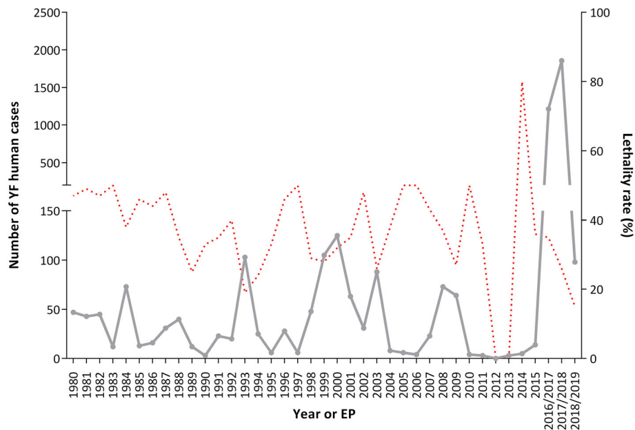
Fig. 2 Historical series of sylvatic yellow fever human cases in Brazil, from 1980 to June 2019. The numbers of cases (grey line) and the lethality rate (red dotted line) are showed by year (1980–2015) or by epidemiological periods (EP) (July to June of 2016/2017, 2017/2018, and 2018/2019). The numbers of YF cases were obtained from Sistema de Informação de Agravos de Notificação (SINAN) and official bulletins from the Brazilian Ministry of Health Brazil and State Health Departments [60–73]

The family Aotidae has one genus, Aotus , popularly called owl monkeys. Six out of eight Aotus species are distributed in the Brazilian Amazon. They are small (0.8 kg to 1.0 kg) and have nocturnal habits [102]. The owl monkeys live in small groups of 4–6 individuals and feed mainly on leaves, fruits, and invertebrates [100].