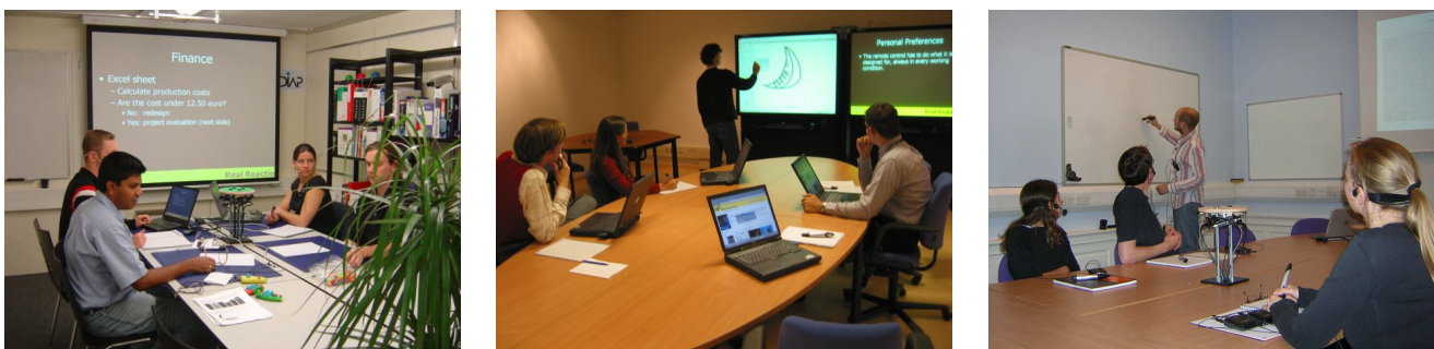
Fig. 1. The three AMI instrumented meeting rooms at IDIAP (left), TNO (centre) and the University of Edinburgh (right).