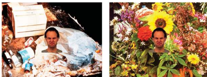
Figure 1. Example of a face–context stimulus. Facial expressions of fear, happiness, and disgust were paired with contexts of fear, happiness, and disgust. These pairs could constitute congruent emotions (left)—for instance, a facial expression of disgust in a context of garbage—or incongruent emotions (right)—the same expression, shown among flowers.

2006). In contrast with our previous study that had used only fearful facial expressions, in the present study, we used facial expressions of disgust, fear, and happiness that could form clear congruent and incongruent combinations with the accompanying emotional scenes.