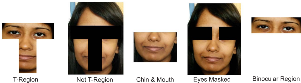
Fig. 2. Sample facial regions presented to participants for age group estimation.