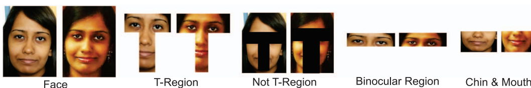
Fig. 3. Sample images presented to the participants for recognizing age-separated images of individuals.

In response to different visual stimuli, the participants need to make a decision on the correct age group. For each face stimulus shown, the participants have to be able to discriminate one among ten age groups which represents the perceptual judgment of each participant. The strongest response denotes the signal and represents the actual age group while the remaining nine alternatives denote noise or uncertainty distributed among other response categories. The distance between the means of the signal and the noise distributions are compared against the standard deviation of the noise distribution to compute the discriminability index ( d' ) [28, 29]. The d' values calculated for each age group stimulus is shown in Table 2 . Higher values of d' signify that the participants are able to discriminate a particular age group category better. From Table 2 , the results show that participants were able to discriminate the two age group categories 0–5 and 6–10 better than any other category and the d' values for these correspond to