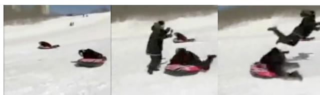
Figure 2 Sequential screenshots from question 1 of the Computational Thinking Pattern Quiz wherein 2 sleds ‘transport’ 2 people down a hill and one of the sledders ‘collides’ with a person at the bottom of the hill.

Question 1 is a video of 2 people sledding down a hill. At the end of the video one of the sledders collides with a person standing at the bottom of the hill. The patterns depicted in this video are ‘transportation’ and ‘collision’ and the participants were specifically asked how this related to something in the “Frogger” game. Figure 2 depicts sequential screenshots of this video as an example as to what these videos looked like. Participants were given credit if they correctly identified either one of the patterns.