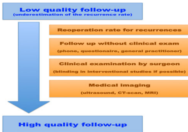
Fig. 2 The validity of data for recurrence after hernia repair is dependent on the method of follow-up performed. It is recommended to consider only follow-up including clinical investigation as adequate

recurrence”. Helgstrand et al. [31] demonstrated using a questionnaire and subsequent selective request for clinical follow-up that the reoperation rate underestimated the overall risk for recurrence by four- to fivefold. In the Herniated registry patients are followed up using a questionnaire send to the patient at 1, 5 and 10 years [29]. Patients reporting a problem are invited for an examination by a physician.