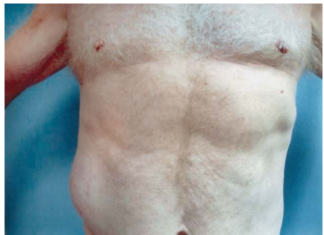
Figure 5. T8 motor neuropathy in an otherwise healthy 59-year-old man who presented with vesicles in the T8 distribution 4 weeks before this photo was taken. The patient was treated with an antiviral agent for 7 days and with analgesics as needed. As the rash resolved, this bulge became apparent; it is consistent with motor damage by varicella-zoster virus to the muscles of the abdomen.

Second cases of HZ are uncommon in immunologically intact hosts, presumably because an episode of HZ will boost immunity and thereby prevent subsequent symptomatic VZV reactivations. The available data suggest that second cases of HZ occur in \leq 5\% of individuals, although this conclusion is limited by the duration of follow-up, uncertainty of the di-