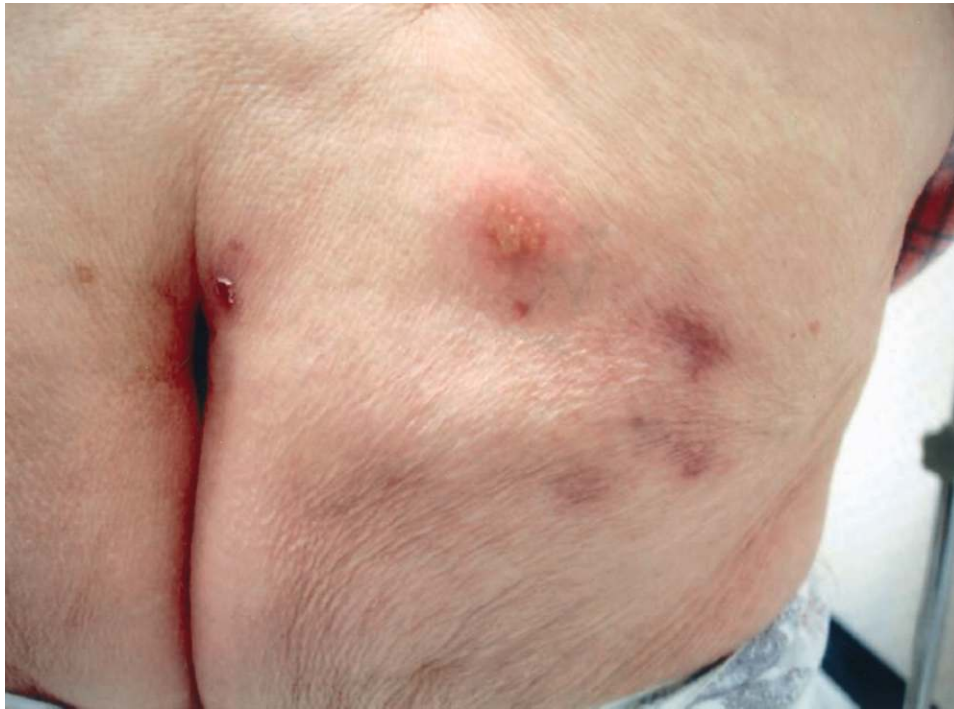
Figure 7. Zosteriform herpes simplex in an elderly woman who presented with what she called “her recurrent shingles.” Vesicles in a lumbosacral distribution had recurred many times over the past several years, and this outbreak began 1 week before the photo was taken. A viral culture demonstrated herpes simplex virus type 2. The patient was otherwise healthy, except for hypertension.

of a similar rash in the same distribution (to rule out recurrent zosteriform herpes simplex; see figure 7); and (6) pain and allodynia in the area of the rash. Allodynia, which is common in both HZ and PHN, is pain evoked by a stimulus that does not normally cause pain—for example, light brushing of the affected area with a cotton swab.