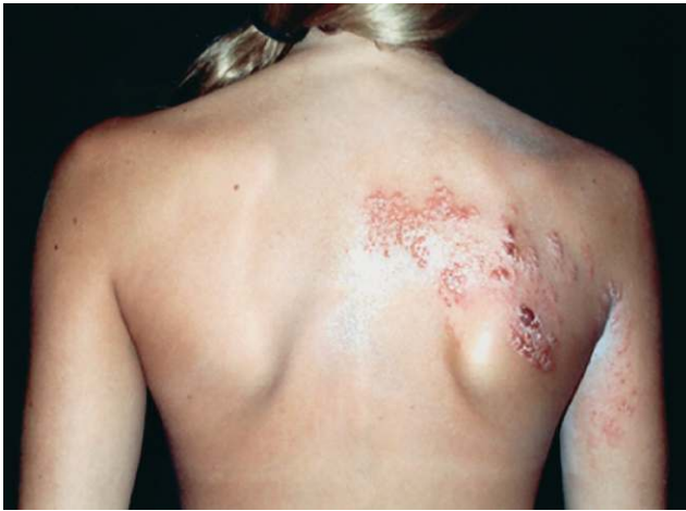
Figure 2. Thoracic herpes zoster

The rash associated with HZ has a brief erythematous and macular phase, which is often missed, after which papules rapidly appear. These papules develop into vesicles within 1–2 days, and vesicles continue to appear for 3–4 days. At this point, lesions of all types may be present (see figures 2–4). The lesions tend to be grouped, and clusters are often seen where there are branches of the cutaneous sensory nerve (e.g., in parasternal, mid-axillary, and paraspinous areas, representing the anterior and lateral branches of the anterior primary division as well as the posterior division of a thoracic nerve). Pustulation of ves-