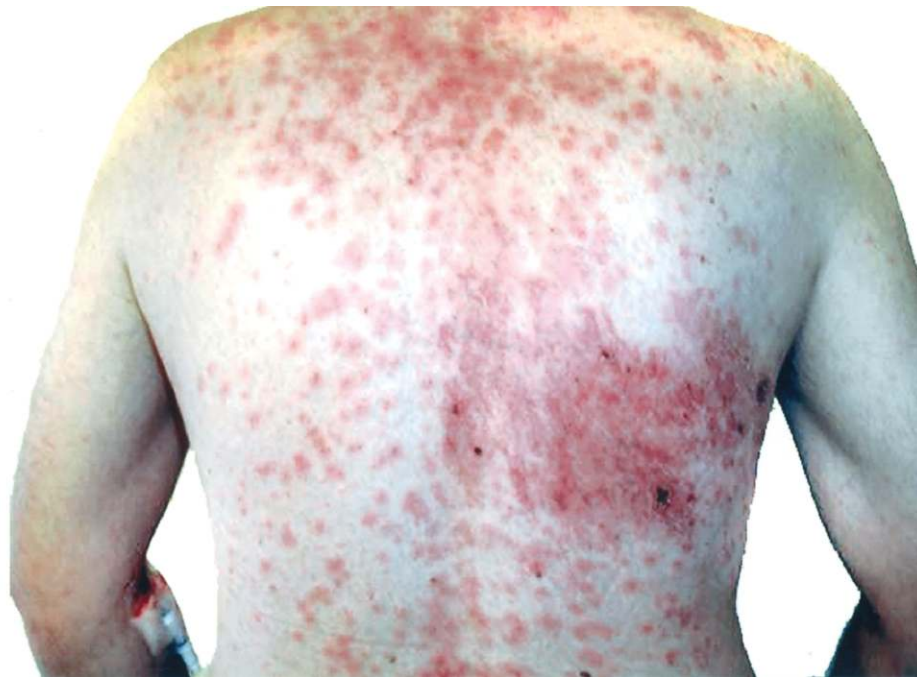
Figure 6. Disseminated herpes zoster

agnoses, and incomplete information about comorbid disease [32–34].