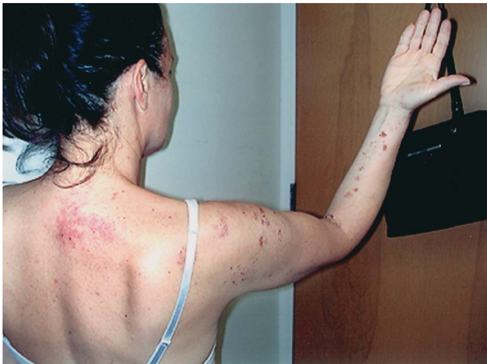
Figure 3. Cervical herpes zoster

In the immunocompetent patient with HZ, there are nu-