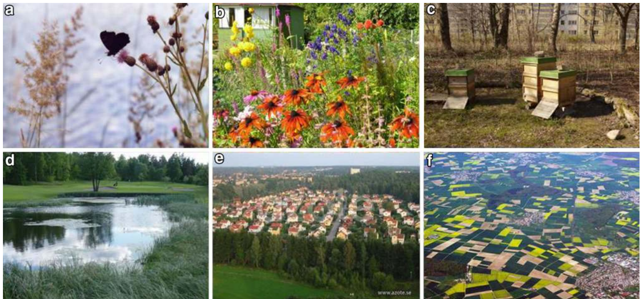
Fig. 1 Local user groups and stewardship of regulating ecosystem services in urban green areas. a Domestic gardens support biodiversity and species of significance in, e.g., pest control and seed dispersal. b Allotment gardens provide critical habitats and food sources during vulnerable animal life history stages. c Community gardens generate ecosystem services like pollination that spill over into the wider landscape. d Urban golf courses function as stepping stones for keystone species with ponds hosting amphibians including endangered and keystone species. e Trees improve air quality and sequester carbon. f Green spaces within cities consist of remnants of biodiversity-rich cultural habitats in an otherwise fragmented landscape

most commonly articulated link between urban green space and human well-being in current urban planning is through so called cultural services, e.g., recreation and health (Tzoulas et al. 2007). Also provisioning services, like food production in, for example, home gardens (Altieri et al. 1999; Krasny and Tidball 2009) and links to biodiversity conservation have been in focus (Goddard et al. 2010; van Heezik et al. 2012).