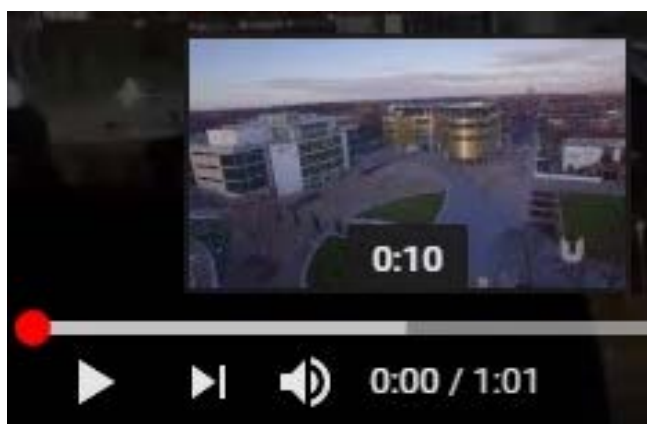
Figure 1: An example of a buffered YouTube stream.

To provide an initial indicator of the presence of content being cached locally, when a YouTube video is loaded, buffering takes place (the download and storage of a portion of video data, ready for playing), indicated by the grey video bar (see Figure 1). To test for the presence of local data, once a portion of the stream has been buffered, the removal of an Internet connection allows some of the buffered portion of the stream to be replayed. Without the ability to access data on the YouTube server, it would appear that this information is being replayed from locally resident content.