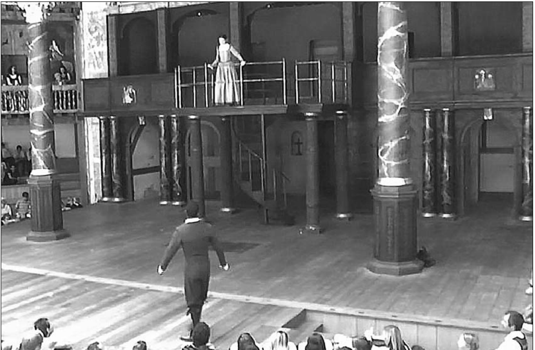
Figure 10 (below). Romeo and Juliet (dir. Dominic Dromgool, 2009).