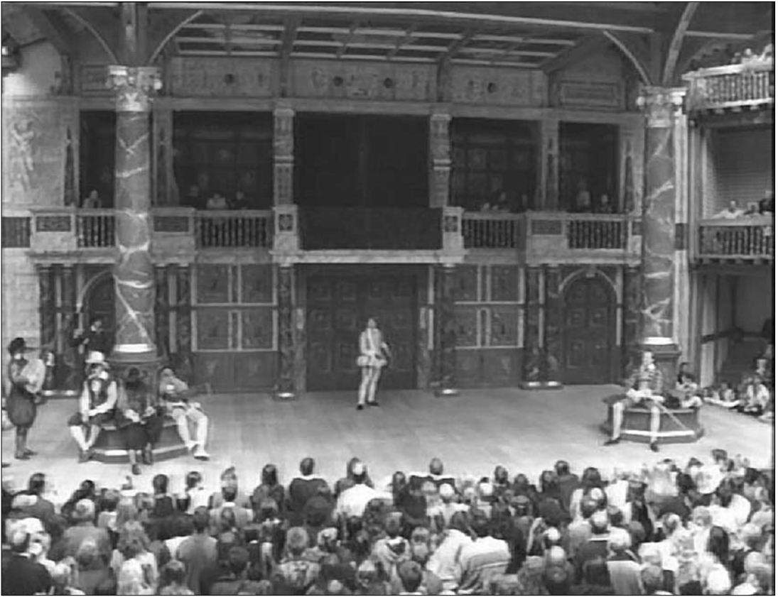
Figure 8. Romeo and Juliet (dir. Tim Carroll, 2004).

few standing members of the audience are unable to see the actor and with a bit of judicious movement, she can reach everyone.