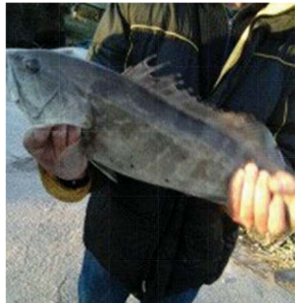
Figure 4 White grouper, Epinephelus aeneus (Geoffroy Saint-Hilaire, 1817): total length 46.70 cm, weight 2.74 kg. Slika 4. Bijela kirnja: ukupna duljina 46,70 cm, ukupna masa 2,74 kg.