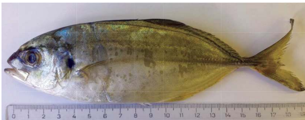
Figure 2 White trevally, Pseudocaranx dentex (Bloch & Schneider, 1801): total length 19.39, weight 94.42 g.

White trevally was noted four times [2], including our, since its first sighting in the Adriatic Sea in 1986 [17]. Specimen was immature so the sex was not able to determine. Measured total length was 19.39 cm and weight 94.42 g. Afonso et al. (2008) estimated that the size at first maturity ( L_{50} ) for this species is 27.8 cm for males and 30.0 for females. Stomach analysis showed the presence of one specimen of big-scale sand smelt, Atherina boyeri Risso, 1810 with standard length of 4.51 cm and weight of 0.71 g. Dulčić et al. (2003) found digested fish larvae and postlarvae and specimens of Mysidacea in stomach of white trevally caught in eastern Adriatic Sea. Immature individuals of white trevally prefer sheltered habitats feeding on invertebrates and small fish [21, 1]