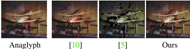
Figure 3. Comparison between different algorithms in terms of reconstruction. We implemented the algorithm described in [10] and used the online code of [5].

based on these correspondences. Each channel is then iteratively matched independently using an optical flow method to produce new good correspondences; the colors are updated using the new correspondences.