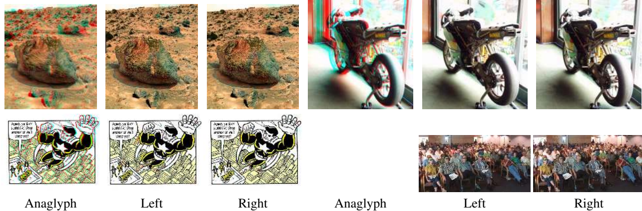
Figure 7. Examples of stereo pair reconstruction. We are able to handle object disocclusions and image boundaries to a certain extent. More examples can be found in the supplementary file.