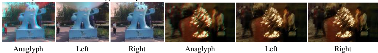
Figure 8. Robustness to asymmetric occlusion (left) and blur and low-light conditions (right). More examples can be found in the supplementary file.