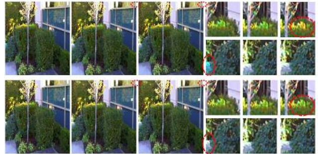
Figure 10. Results for an anaglyph video. Top row: three frames reconstructed independently. The highlighted areas (dotted ellipses) have inconsistent colors across time. Bottom row: results using temporal information. The colors are now more consistent. More examples are shown in the supplementary material.

Figure 10 shows results for an anaglyph video, which illustrate the importance of temporal information on preventing flickering effects caused by inconsistent colors across time. If the frames are processed independently, the resulting color inconsistencies tend to be local and minor, but noticeable.