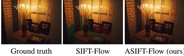
Figure 2. Comparison between the original SIFT-Flow and our version. Notice the incorrect colors transferred for the original SIFT-Flow in the darker lower region.