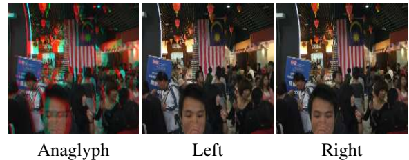
Figure 9. A representative failure case. The red and white part of the flag appears as uniform in the red channel in the left view, so registration in that area is less reliable.

not improve the PSNR significantly, mostly because the areas occupied by occluded regions are typically small (but obvious if colorized incorrectly).