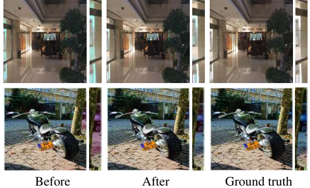
Figure 4. Examples of recolorization of occluded regions with incompatible colors.

Our approach uses the anchor colors to fill in the missing colors. However, objects in disoccluded regions may be incorrectly colored. As shown in Figure 4, for each scene, a border region of the leftmost image is unobserved in the other view, resulting in out-of-place colorization. To detect