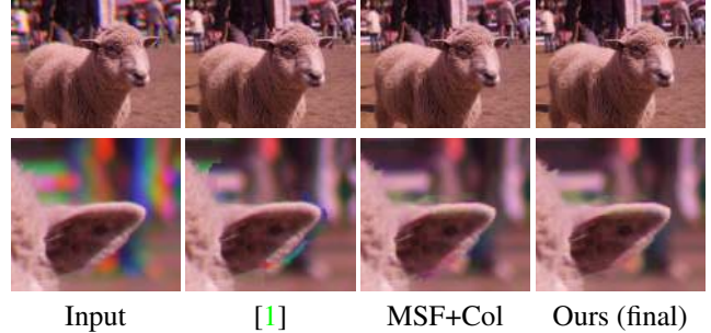
Figure 6. Comparison with Bando et al. [1] on images taken with their camera. “MSF+Col” refers to using our ASIFT-Flow (rough matching) and colorization. The right column is the result of applying our full algorithm. Notice that the results of our technique have less apparent edge artifacts.

The computed PSNR values of our algorithm are shown in Table 1. We see that our method performs better than the baseline. Note that recolorizing occluded regions does