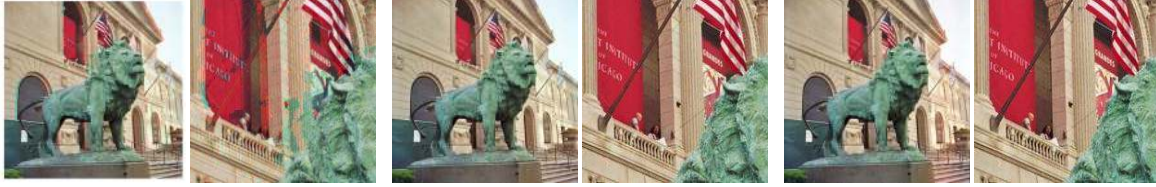
Figure 5. Comparison with Deanaglyph ( http://www.3dtv.at/Knowhow/DeAnaglyph_en.aspx ).