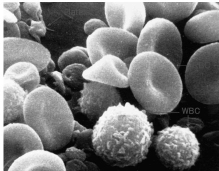
FIGURE 1. Scanning electron microscope image of human blood cells (adapted from [13]).

Blood is a fluid composed of a suspension of cells, proteins and ions in plasma. In normal blood, three types of cells comprise about 46% of its volume. These cells are the red blood cells (also known as erythrocytes), white blood cells (also known as leukocytes) and platelets (also known as thrombocytes). Figure 1 shows different kinds of human blood cells.