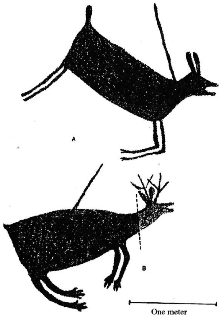
Figure 3. A. Deer from San Pedro (slight restoration of hindquarters in this facsimile).

B. Deer from El Paraíso (heavy restoration of head; other parts in excellent condition).