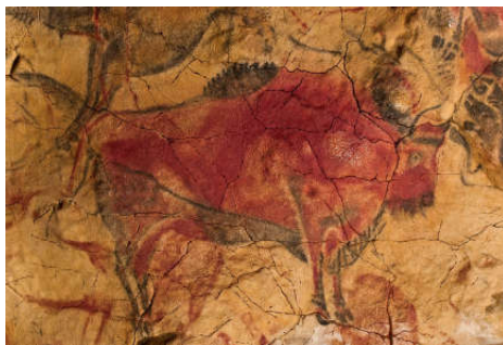
Figure 1: National Museum and Research Center of Altamira

Graffiti is not a new artistic form of 20 th century as claimed in the modern art history books (Farthing, 2011: 552). There is also a discussion that the history of street artistic expression goes back to the Early Medieval (Between 10 th century to 12 th century), and some of the works of arts are under protection as a cultural heritage (Elias, 2009: 110). However, as Tansug (1988) discusses graffiti dates back to prehistorical time. Even before the invention of writing, people draw their lives, feelings and ideas on the walls of the oldest Paleolithic caves in order “[to make their] presence known through images” (McDonald, 2013: 10) ( Figure 1 ). Therefore, it is not founded to claim, “Graffiti is as old as human civilization” (Lannert, 2015). The usage of visual imagery and writing in the form of graffiti continued to exist during ancient time. For example, in Ancient Egypt, there are evident of Christian-inspired graffiti on the entrance of the Palace of Merneptah, which is a palace to celebrate Pharaohs, the kings and sons of the god, Ra ( Figure 2 )(White, 2014: 3). Also Romans wrote their poems on the walls and the Pompeii (see Ohlson, 2010) community had left us information we have today about them on their walls (Tulum, 2012).