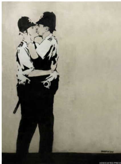
Figure 6: “Kissing Coppers”, a graffiti by Banksy, 2005

Pup in Brighton, Banksy “underscores that love must be free, whatever it is, and accepted by society” (Esmer, 2016).