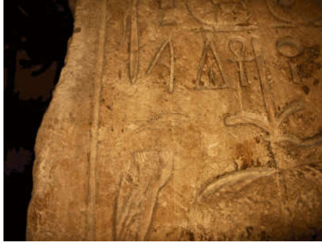
Figure 2: Image of a fish (a symbol of Jesus Christ) is carved at the palace of Merneptah

The history of modern graffiti is a very controversial issue. It was during World War II when “Kilroy”, a long-nosed little character ( Figure 3 ) became a symbol of patriotism and was widely proliferated (Bates, 2014). In addition, during the World War II, graffiti were used as a means of protest. Protestors between the 1960s and the 1980s painted the West side of the Berlin wall (Ivanova, 2013). These graffiti gain “enormous popularity because of their efficiency as transgressive symbols. Later, they were re-conceptualized as predictors of the fall of the Wall” (Ivanova, 2013: 146).