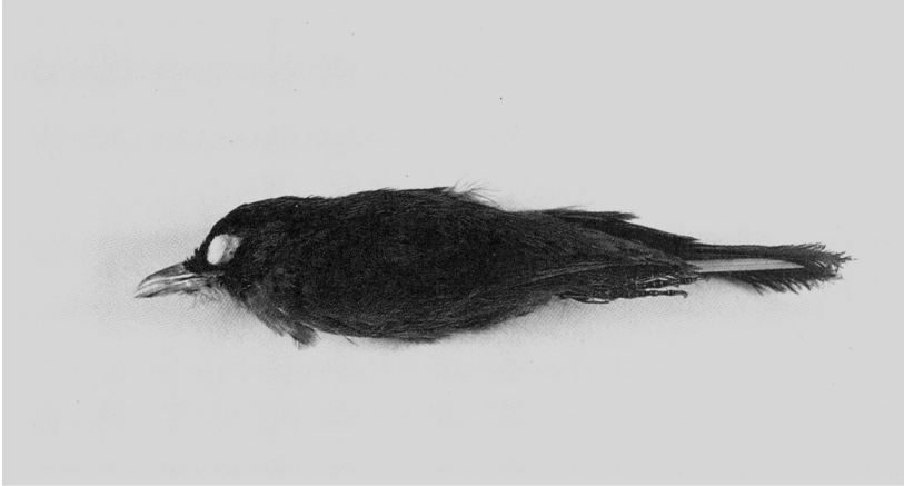
Figure 1. Specimen of Sooty Babbler Stachyris herberti collected at Phong Nha, July 1994 (photograph by J. C. Eames).

Eames et al. 1994). However, we were certainly aware of the possibility that S. herberti could occur in the area.